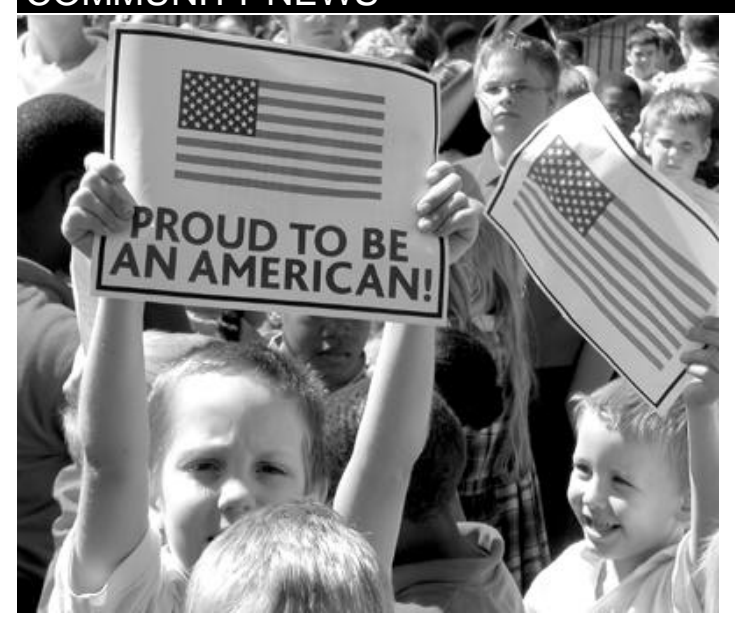
ST. STAN'S CHILDREN REMEMBER SEPT 11!