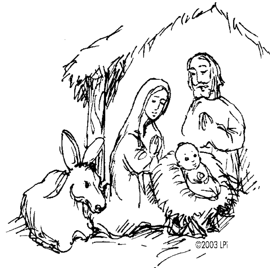
Merry Christmas to all our Parishioners, Visitors and Friends