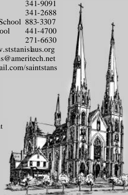
The artist's sketch on the right depicts the original building with the spires. Corner Stone laid in 1886, and church dedicated in 1891.

PHOTO ALBUM www.picturetrail.com/saintstans