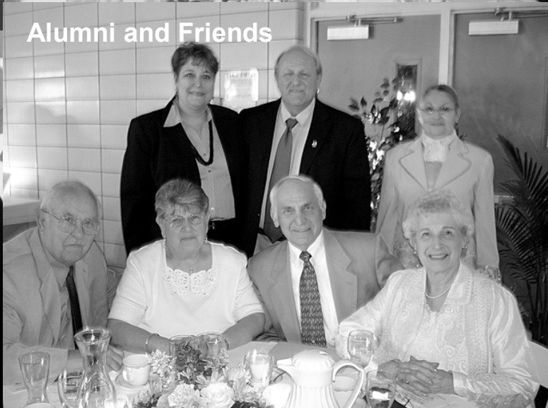
Alumni and Friends