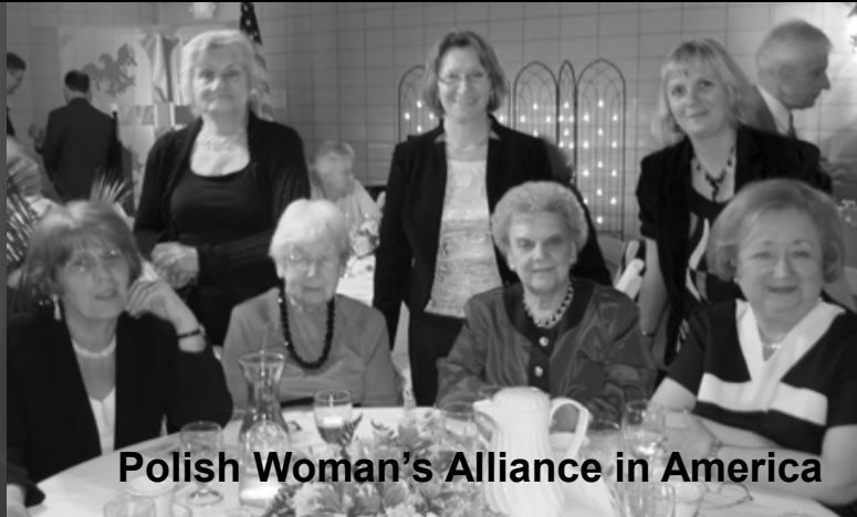
Polish Woman's Alliance in America