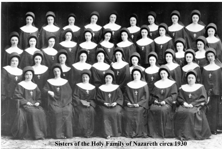
Sisters of the Holy Family of Nazareth circa 1930