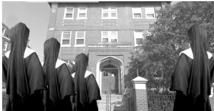
The convent in happier days