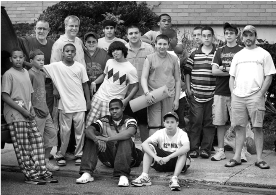
The Lil' Bros group is back from their annual excursion into the wilds of Wisconsin. No one was eaten by a bear and it seems they all had a good time—even the chaperones.

The Student Theatre Enrichment Program (STEP) presented Eye, Mind, Heart , an original play inspired by Hans Christian Andersen's The Snow Queen . The 2009 STEP project was brought to us for the third year in a row by the Warsaw Music Festival. The Cleveland Public Theater Step Program is a wonderful opportunity to engage youth in writing, directing and intense physical and vocal training that teaches focus, listening and self-control and provides a safe atmosphere for constructive self-expression. Over two hundred spectators were treated to an excellent evening of theater last Monday.