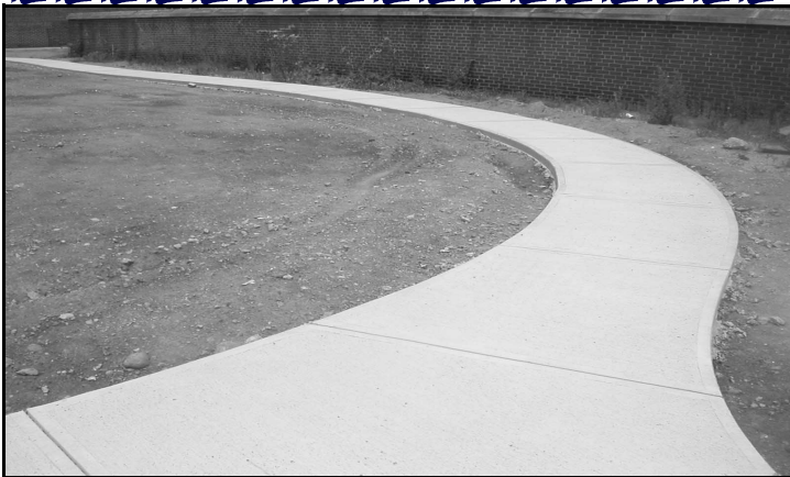
....follow the yellow brick road.....