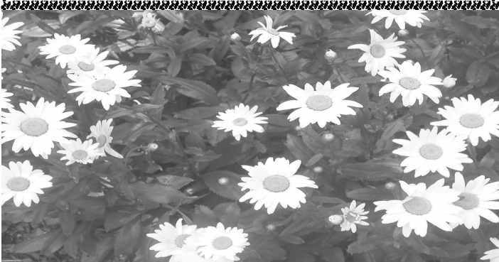
Who's pushing up daisies in our peace garden???????????????

While there is no fee, registration is certainly required. Please call the Vocation Office for more information or to register at 44-943-7630.