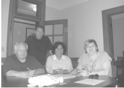
This past week's festival planning kick-off meeting!