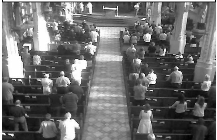
Guess which Weekend Mass this is....

About the Cleveland Catholic Forum: We are a group dedicated to fostering Faith, Family and Freedom by reaching out to all individuals who desire to enhance their relationship with God.