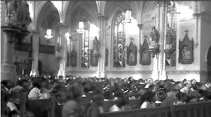
The entire school attended a special Mass last Friday as the school year commenced. It was great to see pews really full of many new and old faces ready to take on the challenges of the new year!

11:30 Mass celebrating the 125th Anniversary of the Sisters of the Holy Family of Nazareth in the U.S. Followed by the dedication of Nazareth Park in their honor, and blessing the fourth floor of the school.