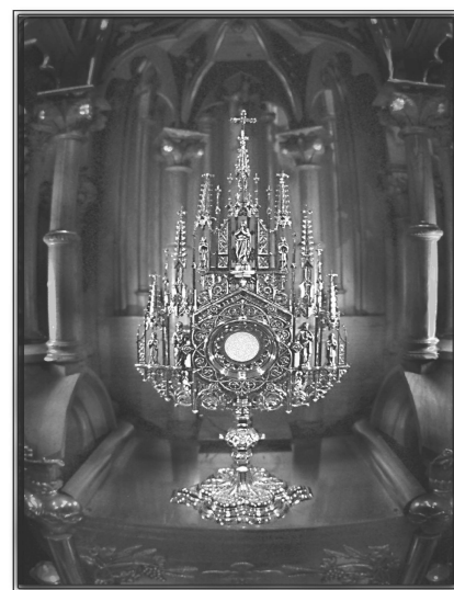
St. Stanislaus Church, Cleveland, Oh. Monstrance

I want to be Your grain that You might grind me up; I want to be Your bread that You might break me; I want to be the vine’s grape that You might press me; I want to be Your olive that You might crush me! The smaller will I be, the greater You become- So small I will love You! When I’ll become nothing, You’ll be everything; I want to become Love in Your heart! Rest in me, my Beloved, My Lord, My All! Rest in me my Dearest Lover!