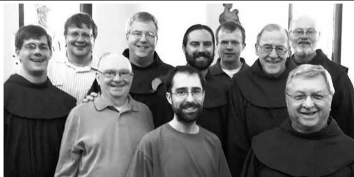
Ten friars at our recent Provincial Chapter had served, studied, or resided at Saint Stanislaus. Can you name all ten?