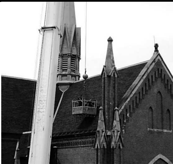
Last week we had major repair work done on three roofs. Because the damage was from storms, insurance covered the cost, minus a $1,000 deductible paid by the parish. By keeping up with repairs, we have been able to extend the life of the roof much longer than anticipated.