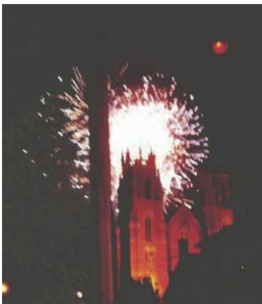
Annual Independence Day fireworks at Morgana Park with the church set in a dramatic foreground. The day was "good in the 'hood!"