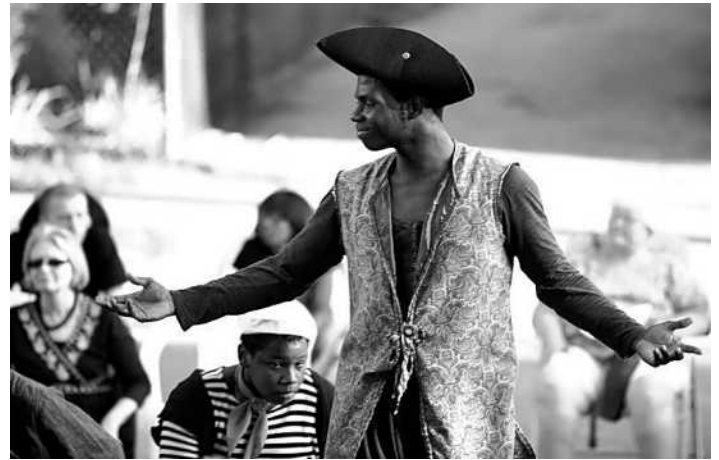
Last Monday's performance by the STEP performers of the Cleveland Public Theatre was wonderful! The teens really did a great job. Even though the audience was pretty small, the ensemble performed as though they were on stage at Stratford!