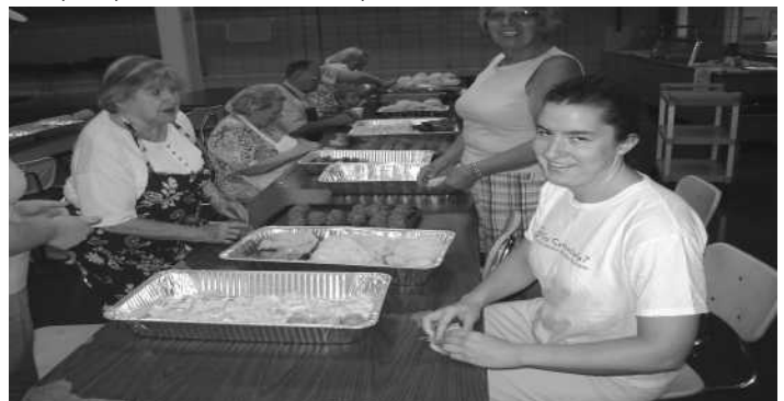
Will anyone notice if we sample a few??? Meg? Perish the thought!