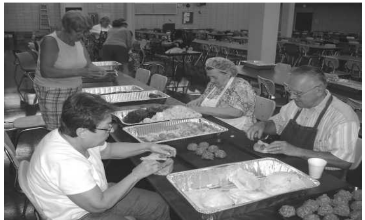
Roll, roll, roll the birds....stuff, don't think! Roll those babies!!!