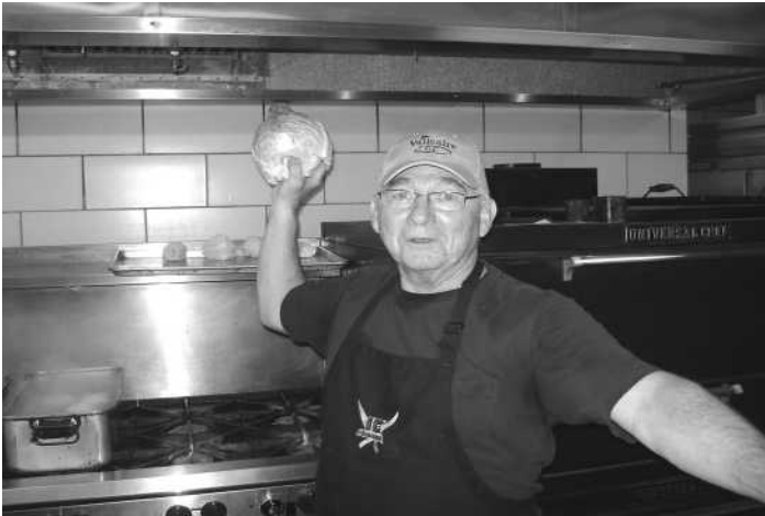
Someone has to threaten the photographer who might be stealing the secret family recipe!! Patrick?? Be nice!!!

It takes a village to make great stuffed cabbage!!!!