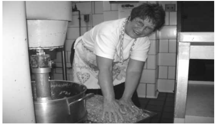
Someone has to mix the meat!!! Can that be Pani Calamante??