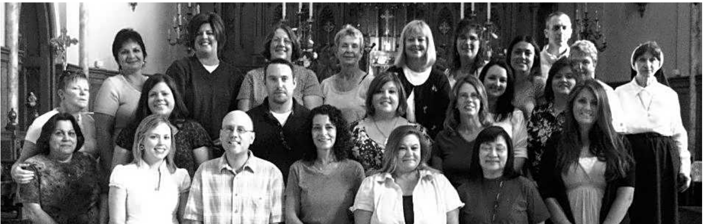
The first happy faces to come to the new school year are always the faculty and staff! School starts this week Wednesday.