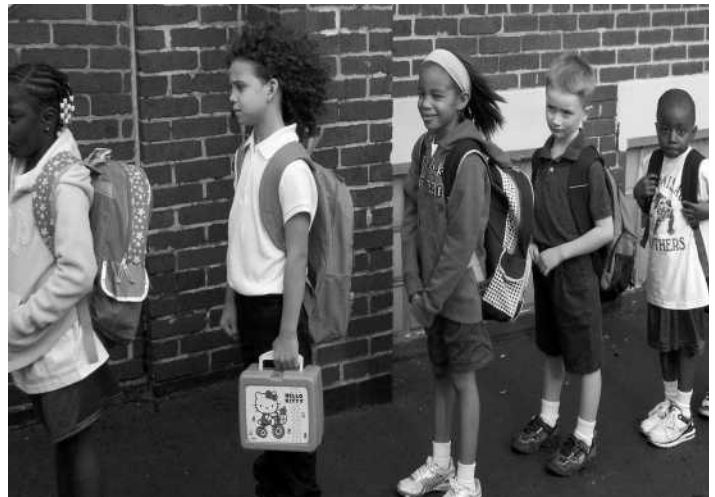
First day of school pics....