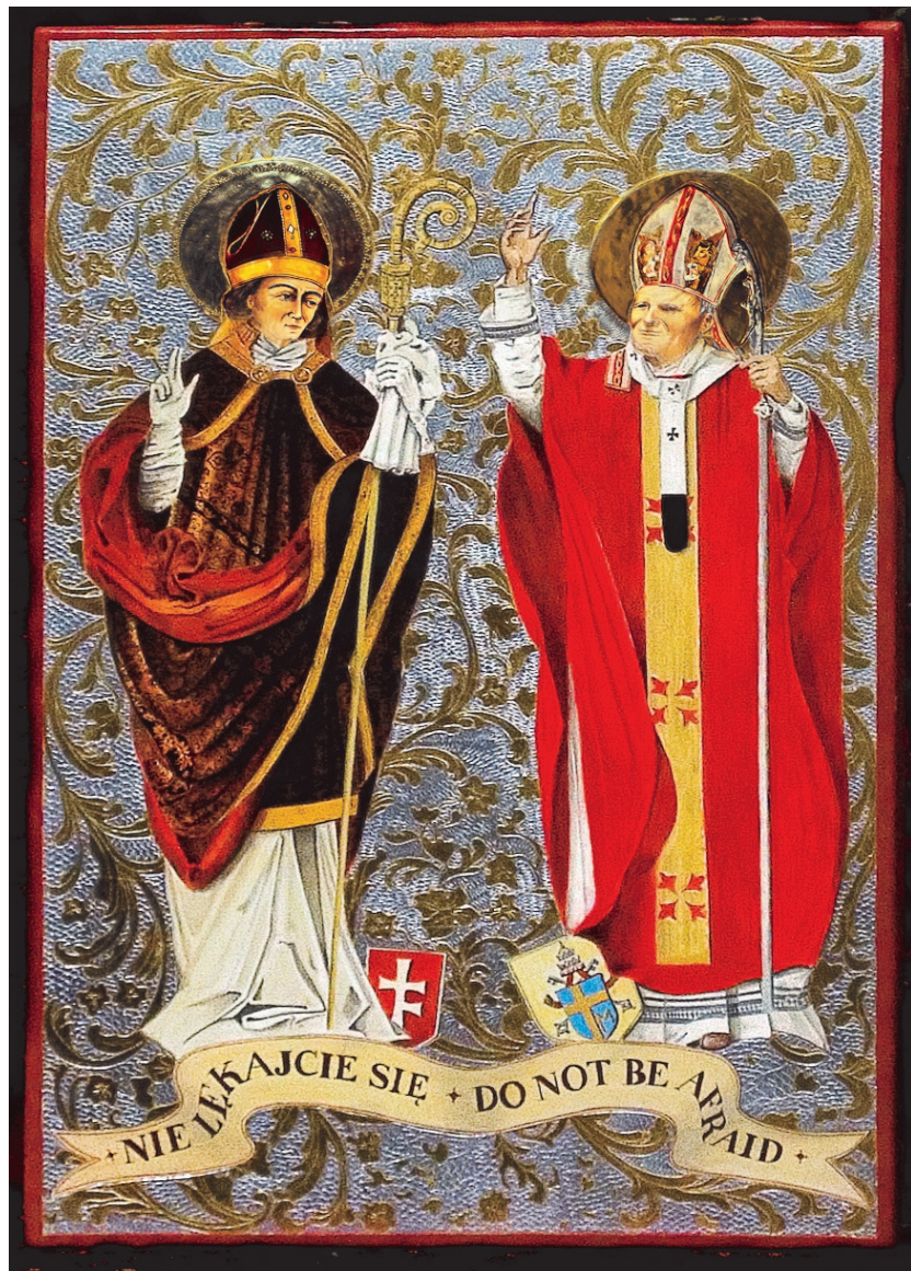
Icon of Saint Stanislaus and Blessed John Paul II