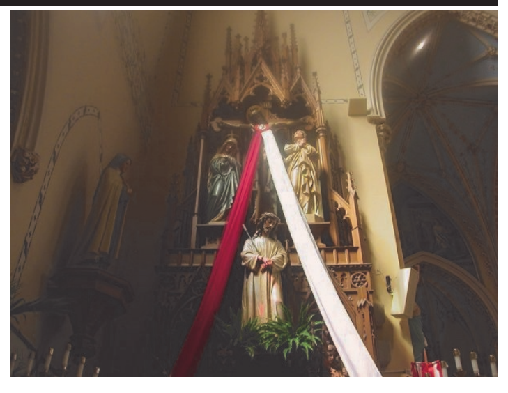
Would you like to keep seeing this altar in our church?

For further information please visit <u>maltzmuseum.org</u> Or call them at 216-593-9575. The museum is located at 2929 Richmond Road in Beachwood, OH 44122.