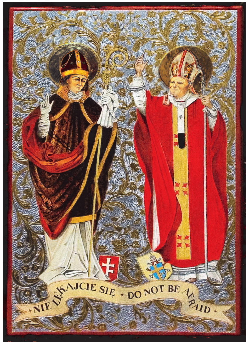
Icon of Saint Stanislaus and Blessed John Paul II