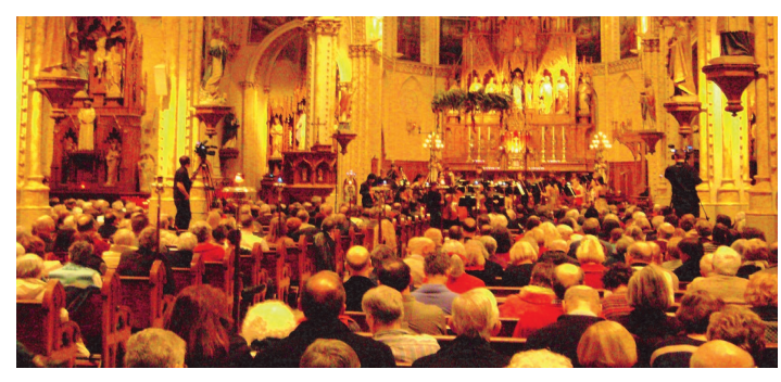
A crowd of 1,200 people at the CityMusic Christmas concert on the 15th of December.