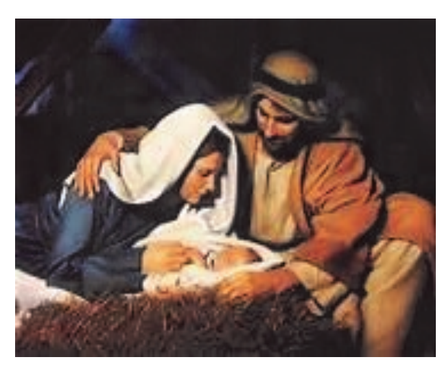
FEAST OF THE HOLY FAMILY

7:00am (except Saturday) and 8:30am National Holidays 9:00am