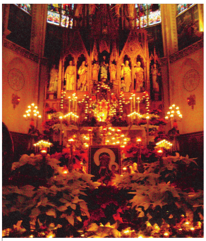
The Sanctuary on Christmas morning, 2012