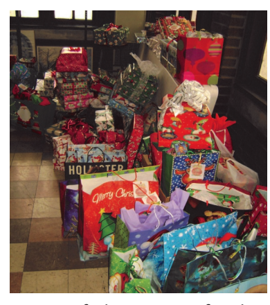
Some of the many gifts donated by parishioners for this year's 'giving tree'.

Here is the translation of the Holy Father's traditional Urbi et Orbi message on Christmas Day.