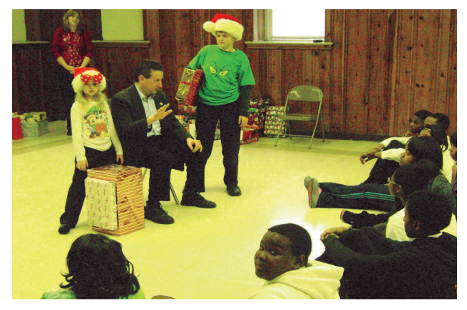
The Zeszut family distributed the parish 'giving tree' gifts to all the children on the morning of Dec. 17th.