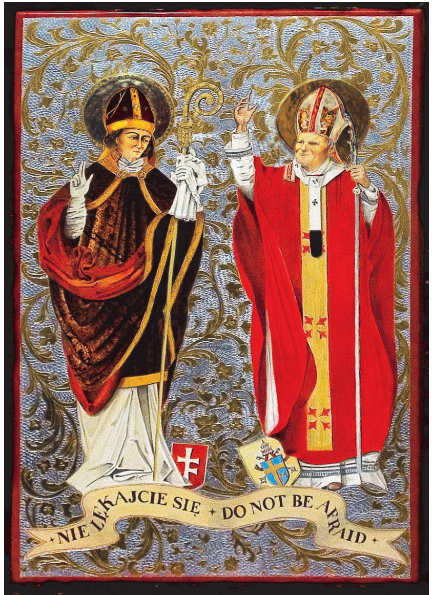
Icon of Saint Stanislaus and Blessed John Paul II