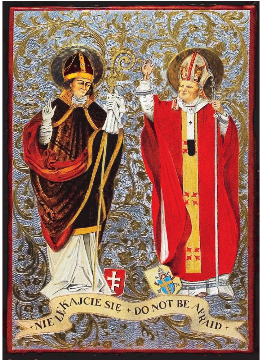
Icon of Saint Stanislaus and Blessed John Paul II