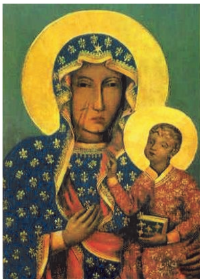
BOGURODZICA—She Who (as a servant) gave birth to God