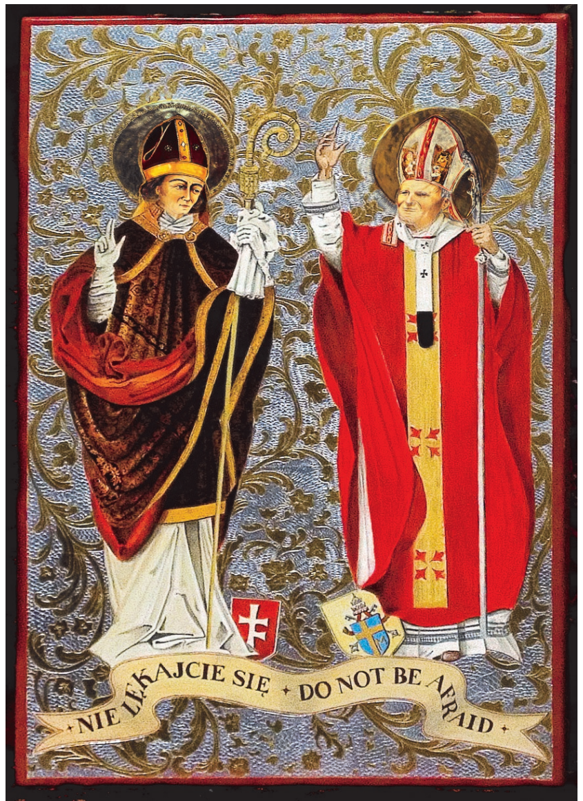
Icon of Saint Stanislaus and Blessed John Paul II