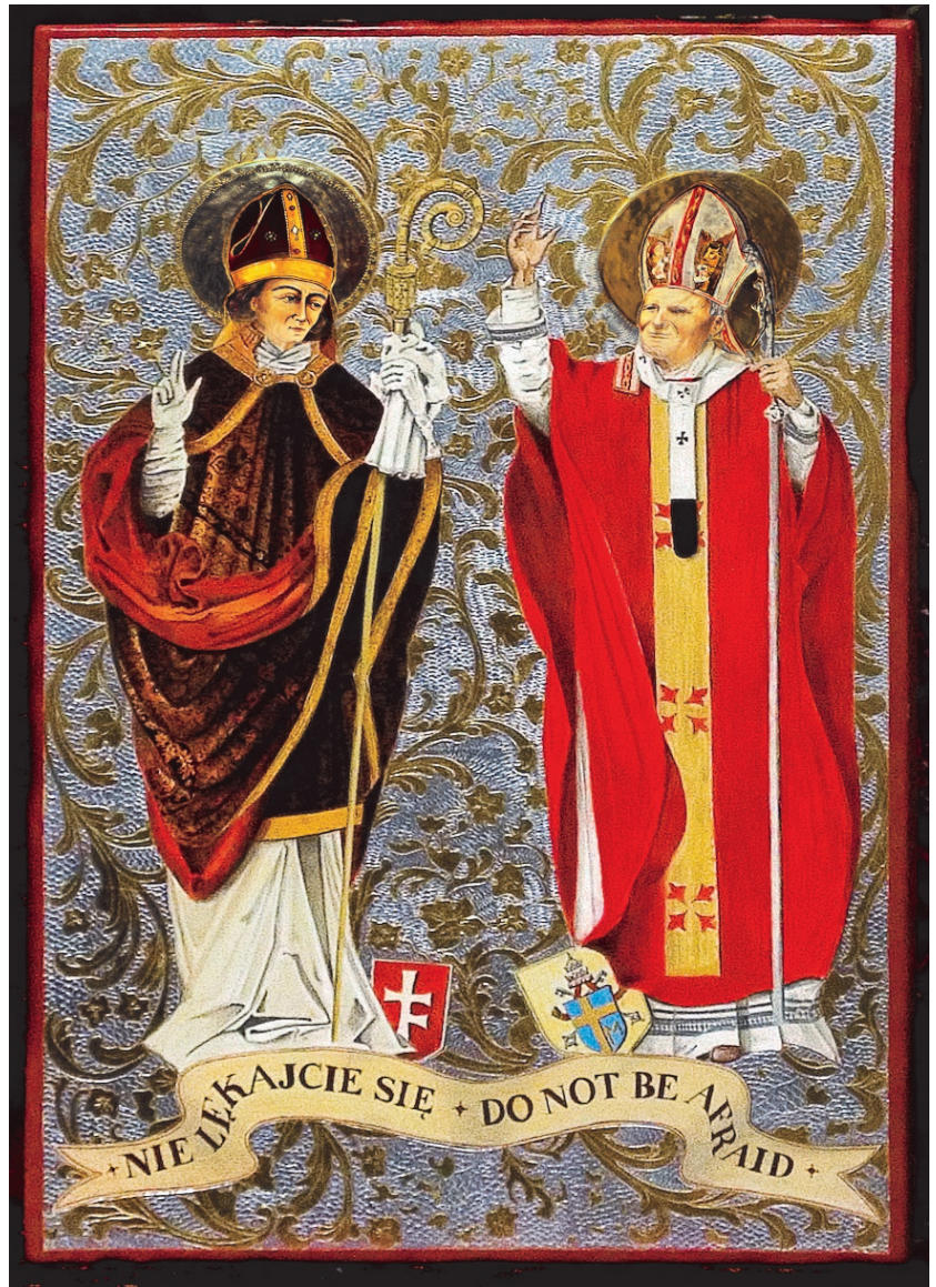
Icon of Saint Stanislaus and Blessed John Paul II