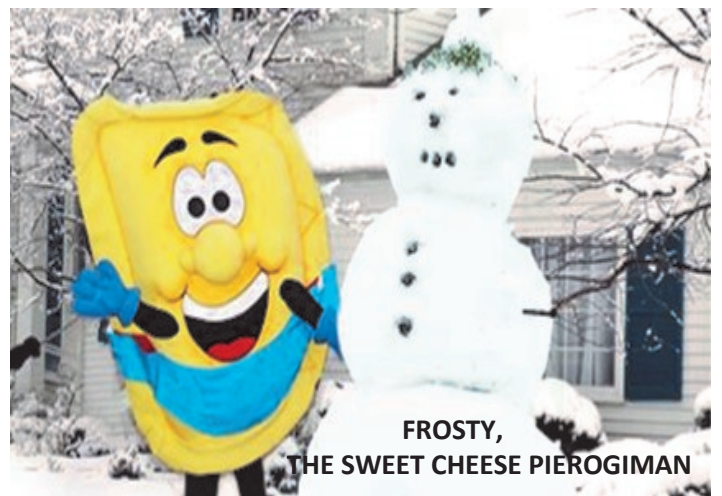
FROSTY, THE SWEET CHEESE PIEROGIMAN

FYI...those interested in joining the RCIA program will have their first meeting next Sunday, December 22 at 10 AM in the parish rectory. If you know someone interested in becoming fully involved in the sacramental life of the Church, please pass on the word!