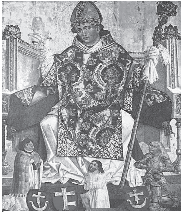
Sw. Stanislaw Szczepanowski. Kan.: 8 wrzesnia, 1253 r.

ok. 1030-79, Biskup krakowski od 1072; późniejsza tradycja wywodzi go ze wsi Szczepanów, stąd nazywany Szczepanowskim a. ze Szczepanowa, ale rzeczywiste jego pochodzenie nie jest znane. Niewątpliwym faktem historycznym jego życia jest zatarg, w jaki popadł z Bolesławem (zob.) Śmiałym.