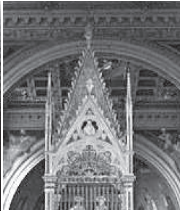
"Baldachino from the Basilica of St. John Lateran"

In case you have not carefully examined the icon shrine in the east transept of the church you might have not noticed the similarities of the carving immediately above the icon of St. Stanislaus and St. John Paul II. The design was purposely derived from this papal baldachino in Rome, a nod to the papacy of St. John Paul II.