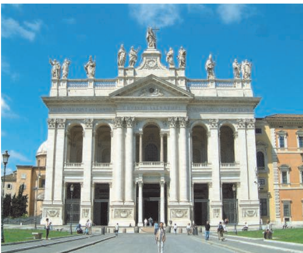
St. John Lateran Basilica