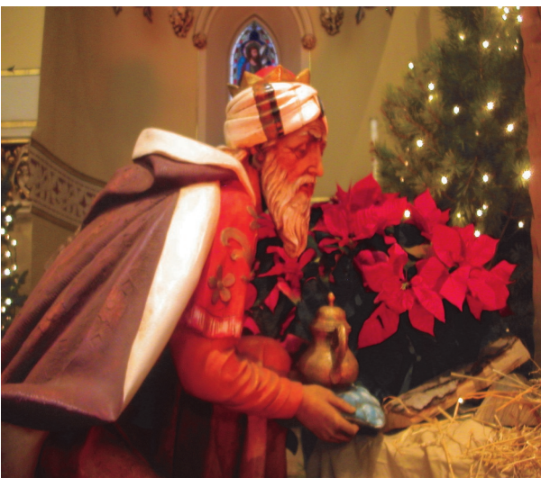
The return of the headless king.....