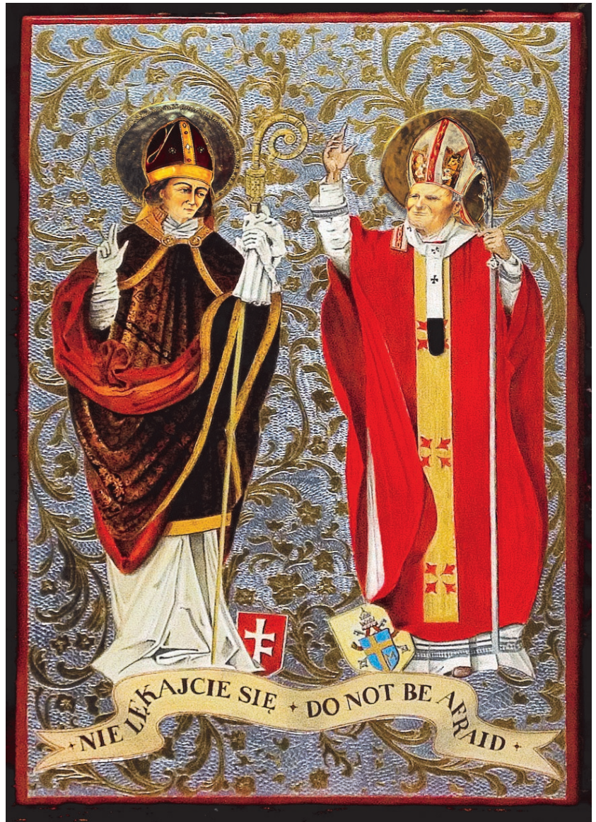
Icon of Saint Stanislaus and Saint John Paul II

Daily Mass: 7:00am (except Saturday) & 8:30am