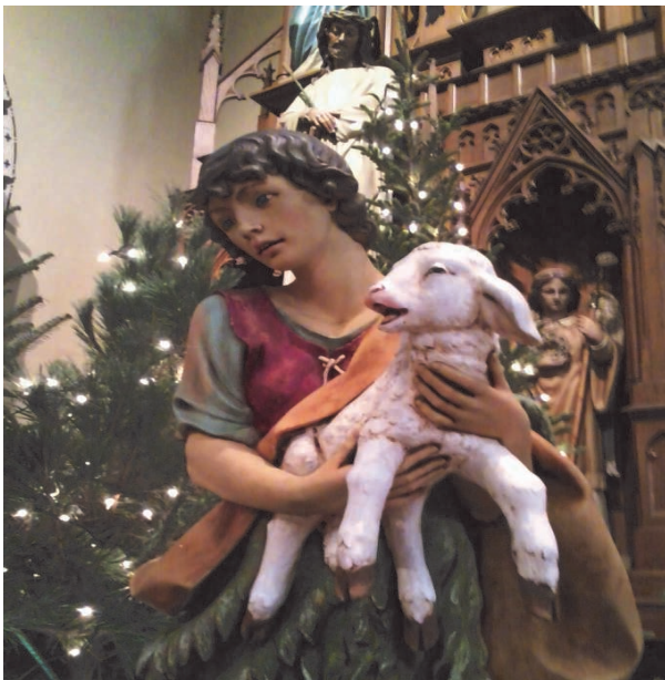
Behold the Lamb of God.....