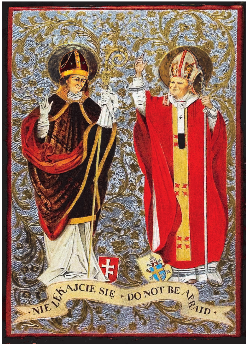
Icon of Saint Stanislaus and Saint John Paul II