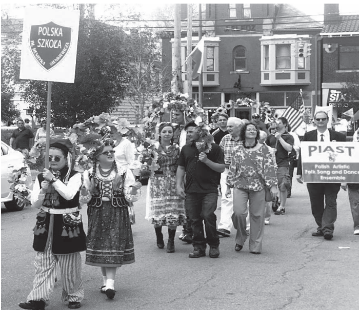
Pic of last Sunday's May 3rd Parade in Slavic Village