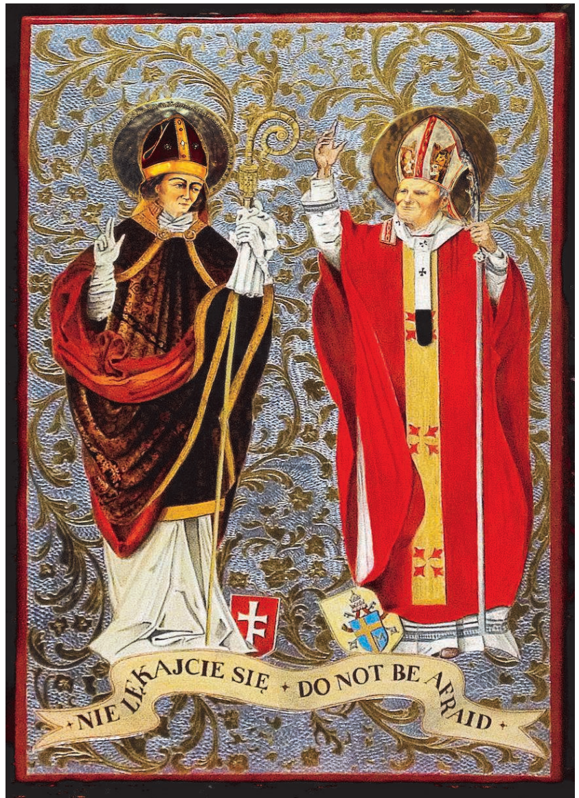
Icon of Saint Stanislaus and Saint John Paul II