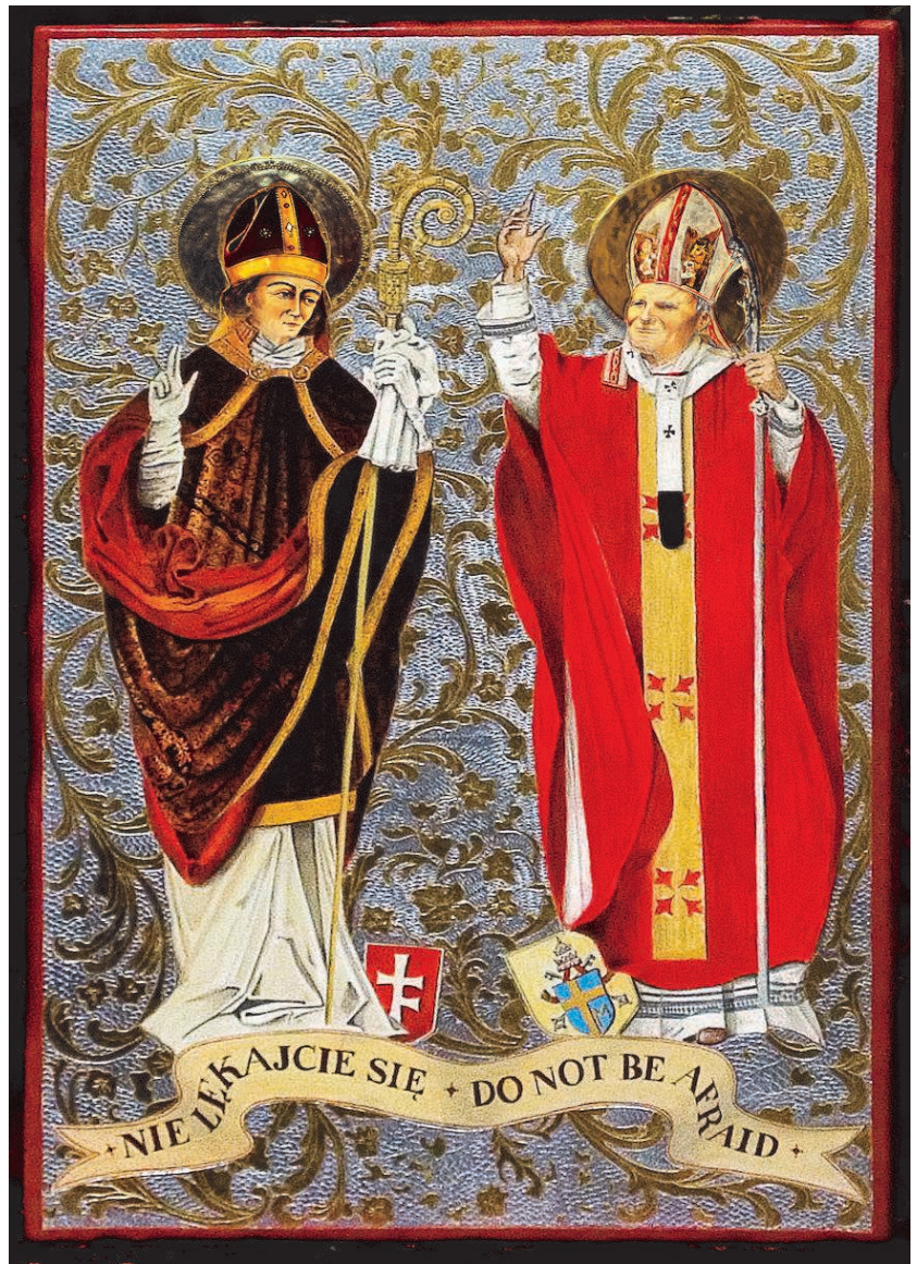
Icon of Saint Stanislaus and Saint John Paul II