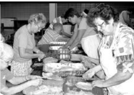
Stuffing Cabbage for Golabki