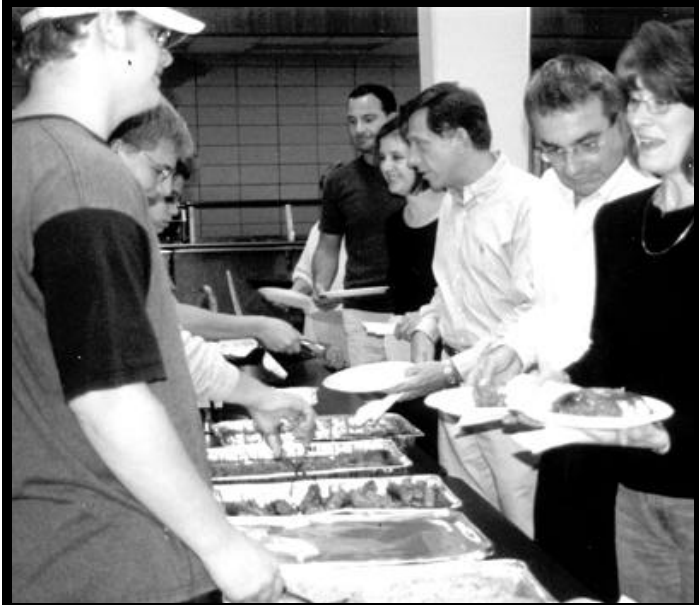
Serving our volunteer workers at the Appreciation Dinner, Oct. 11