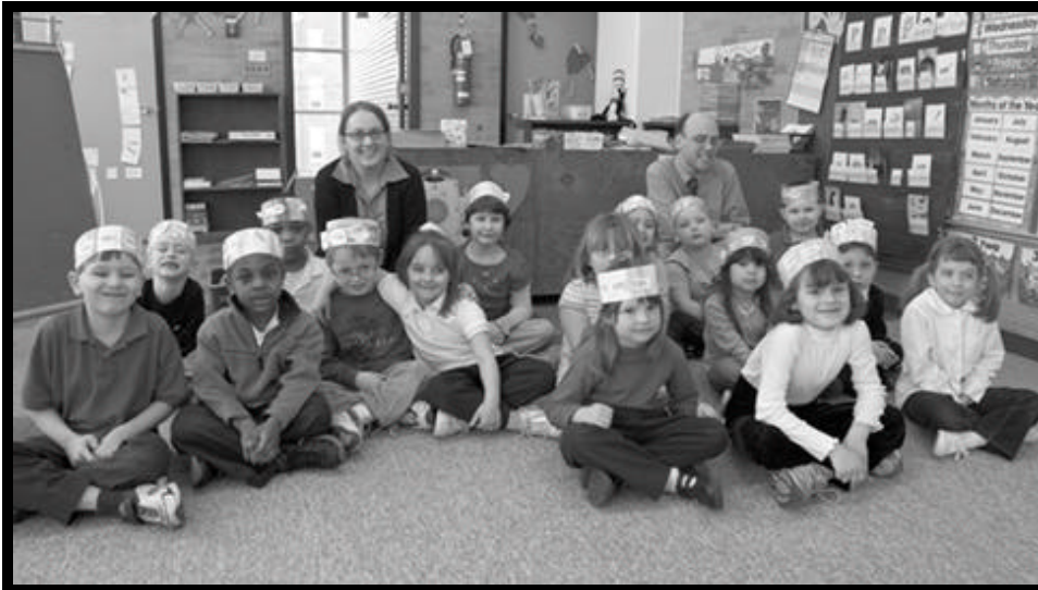
The Kindergarten Class of St. Stanislaus School celebrates the 100th day of school with a party. Songs and refreshments were served to their parents and friends. Our new Kindergarten Center has gotten great reviews from parents and kids. Register now!