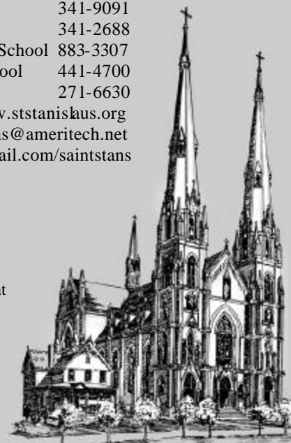
The artist's sketch on the right depicts the original building with the spires. Corner Stone laid in 1886, and church dedicated in 1891.

PHOTO ALBUM www.picturetrail.com/saintstans