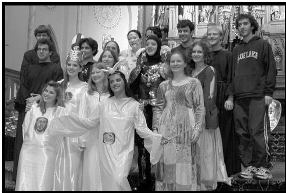
Student performers of Oberlin Conservatory in last week's Cleveland Premier of "Ordo Virtutum" by Hildegard von Bingen

A group of women parishioners is promoting a weekly time out for personal reflection, prayer, and sharing in the church. The schedule April 1, and April 15 from 7:00-8:00 PM and April 5 from 5:30-6:30 PM