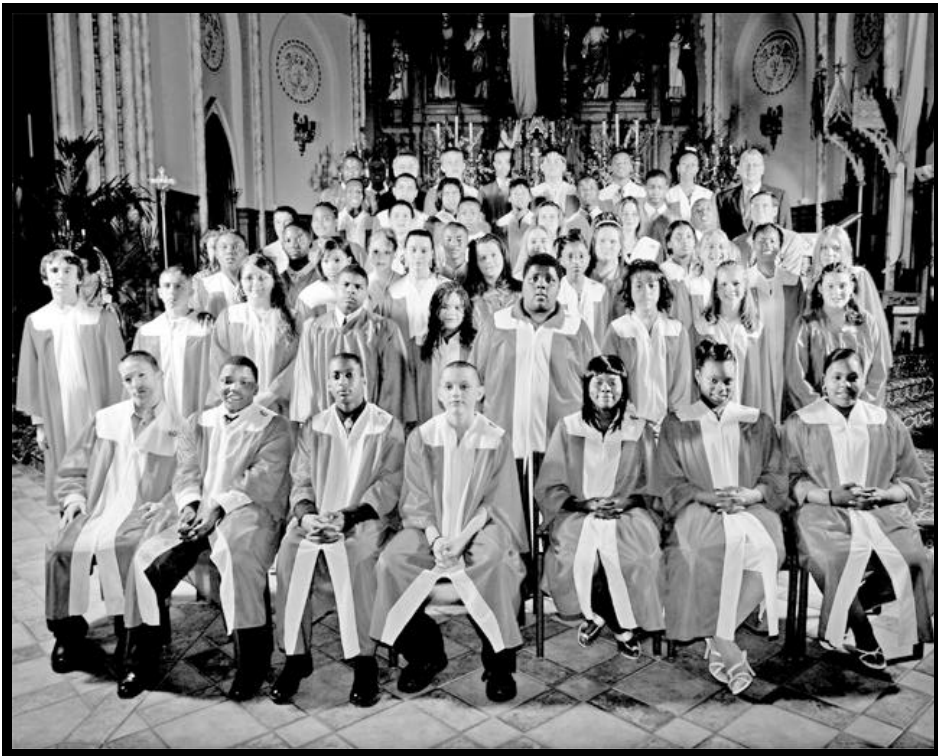
CONGRATULATIONS TO THE ST. STAN'S GRADUATION CLASS OF 2006