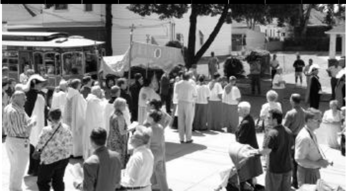
Over one thousand worshippers participated in the Corpus Christi procession last Sunday.