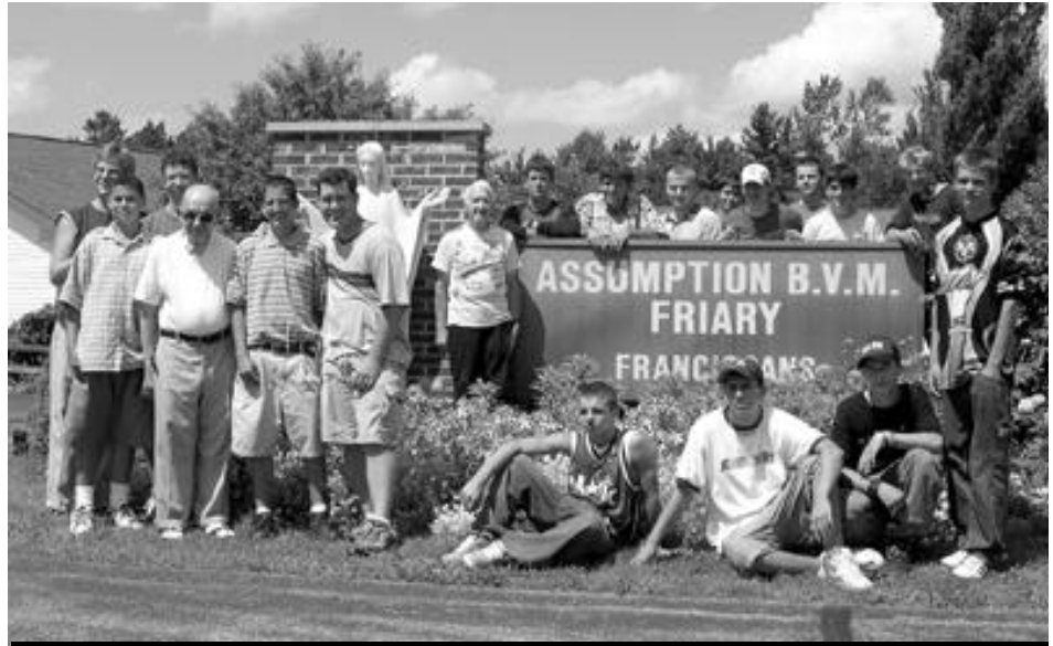
Lil Bros Club of St. Stanislaus enjoying a week as guests of the Franciscans!

The Polish Army Veterans, General Sikorski Post 203 will be selling flowers in front of church at all Masses this weekend, August 2-3. The proceeds of the flower sale go for the benefit of disabled veterans.