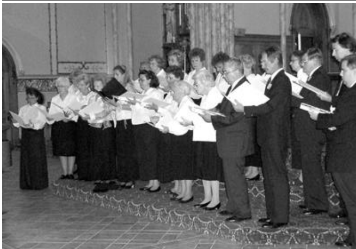
The Polish Singers Alliance of America (PSAA) District IX from Buffalo NY. Along with the St. Stanislaus combined choirs gave a magnificent performance at our Church last Sunday, celebrating the birthday of St. Stanislaus, bishop and martyr, Patron Saint of Poland.