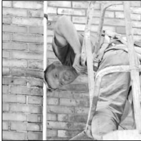
Workers used a crane to reach the top of the downspout while replacing it.