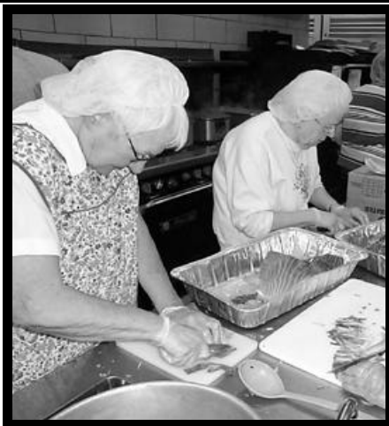
MAKING CABBAGE AND NOODLES

Sunday, October 3rd 12:00pm to 8:00pm Food will be served from 12:00pm until we sell out. Dance to the music of Ethnic Jazz with a live broadcast with Prime Time Polkas 1300AM from 6:00pm to 8:00pm. Our sweepstakes drawing will be done during the live broadcast.