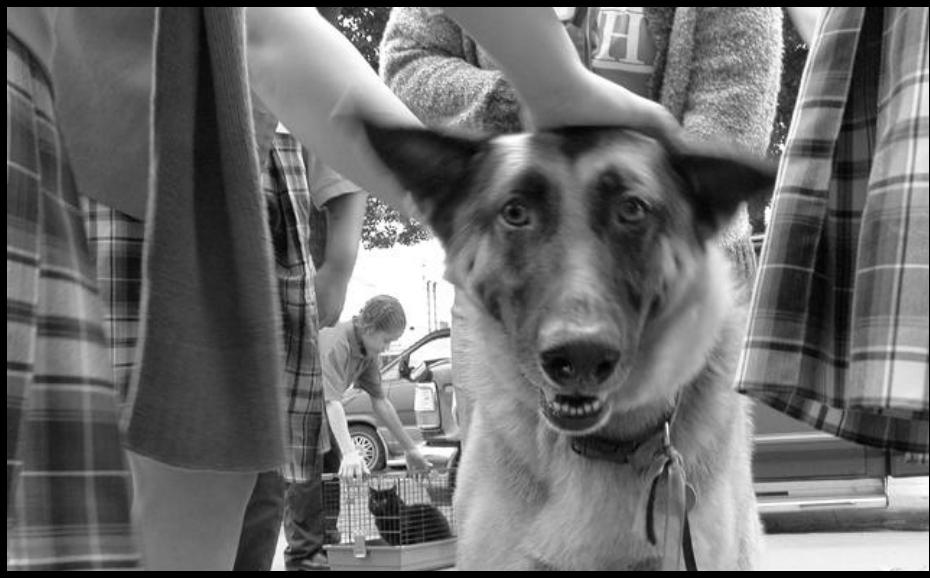
Fritz is a blessed dog—having received a blessing on The Feast of St. Francis at 2:00PM along with his furry friend behind him and other critters that St. Francis loved.

ST. VINCENT De PAUL DONATIONS REQUESTED. Please donate used furniture to St. Vincent De Paul's Cleveland Furniture Bank. Mattresses and box springs are especially needed! The Cleveland Furniture Bank, sponsored by the St. Vincent de Paul Society is experiencing an ever increasing number of requests from nearly seventy Catholic and other faith-based and governmental social service agencies in Greater Cleveland. If you have any unbroken, clean, and unstained mattresses, box springs, couches, tables, chairs, dressers and working major appliances that you no longer need, we welcome year donation! While thousands of pieces of furniture are distributed annually for free through our voucher programs, we also sell some furniture at low prices to those on limited budgets in the SDVP Thrift Store. All profits are applied to pay the cost of picking up, sanitizing and handling the donated goods. To donate, call 216-741-7837, ext 101 to schedule a free pickup at your home. Thank you for all you do to help those in need.