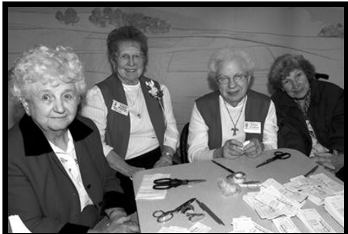
For more pictures go to our website photo album access through www.ststanislaus.org