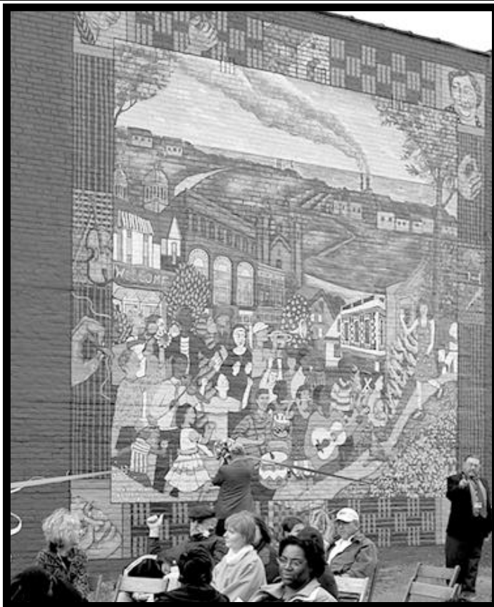
Broadway Ave. Mural Dedicated on October 22, 2004. Many St. Stan's people took part in the 6 month project.. The Mural depicts the history and diversity of the neighborhood.