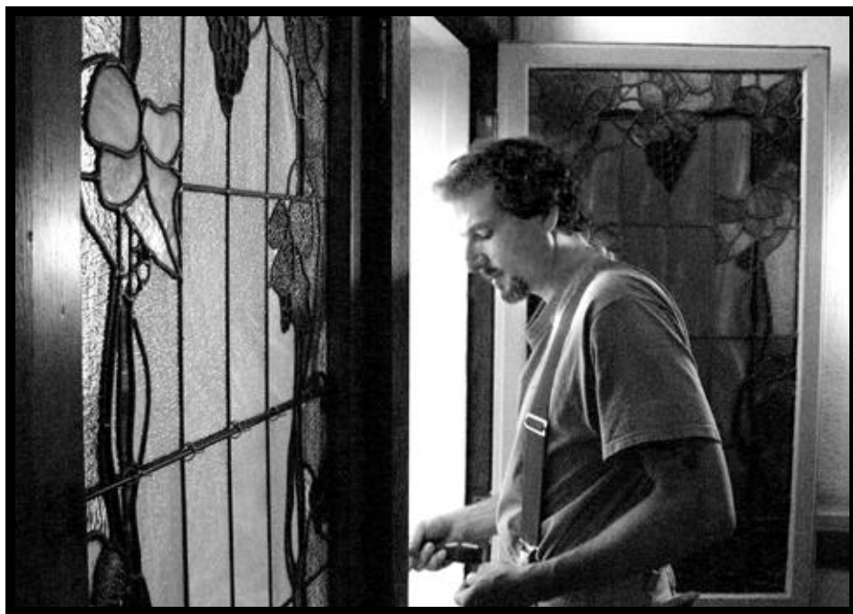
Getting Closer to Completion! A carpenter installs the restored stained glass windows in the stairwell to the Rectory's second floor.

Zgodnie z przyjętą w naszej parafii tradycją Dzień Eucharystii przeżywamy co roku w ostatnia niedzielę przed Adwentem - w Uroczystość Chrystusa Króla. Podobnie i w tym roku czcimy Chrystusa w Najświętszym Sakramencie w ostatnia niedzielę roku kościelnego czyli 21 listopada. Nabozenstwo rozpocznie się wystawieniem Najświętszego Sakramentu do prywatnej adoracji bezpośrednio po Mszy św. o godz. 11:30. Zas o godz. 4:00 po południu będzie nabozenstwo końcowe ze wspólnotową adoracją, które zakończymy uroczystą procesją i błogosławieństwem Najświętszym Sakramentem. W tym roku nasze uroczystości będą miały szczególny charakter, gdyż w nabozenstwo włączone będzie poświęcenie odrestaurowanej plebanii. Prace renowacyjne dobiegają końca. W najbliższą sobotę, 13 listopada, nastąpi uroczyste przecięcie wstęgi i otwarcie budynku, zaś w czasie nabozenstwa Eucharystycznego w Uroczystość Chrystusa Króla plebania zostanie pobłogosławiona, aby od tego momentu znowu służyła parafii zgodnie ze swoim przeznaczeniem.