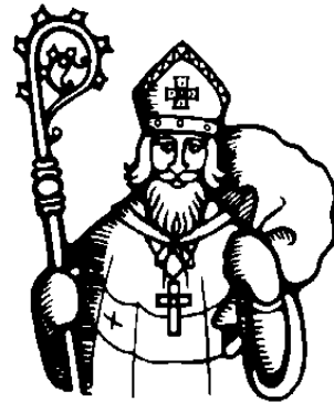
December 6 St. Nicholas Day